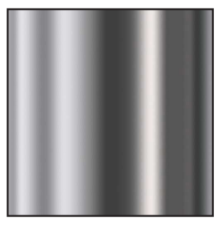
Clear Specular -62