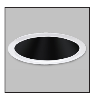
White Flange, Black Trim (-30F-38T)