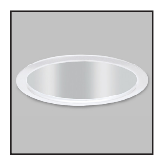
White Flange, Clear Specular Trim (-30F-62T)